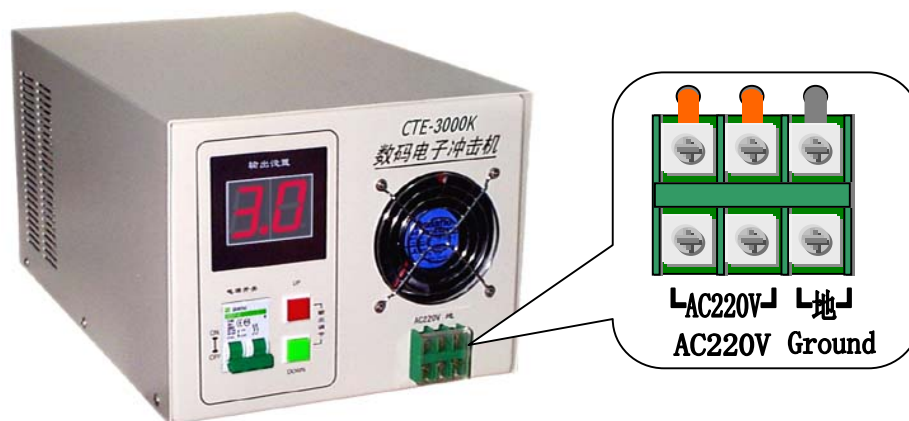
图 3、主机和 AC220V 电源的连接 Figure 3. Connect the generator to AC220V power